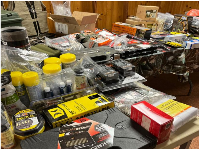
Some of the swag raffled off

12th Annual Sportsmen's Fall Classic Barre Sportsmen's Saturday, September 24, 2022