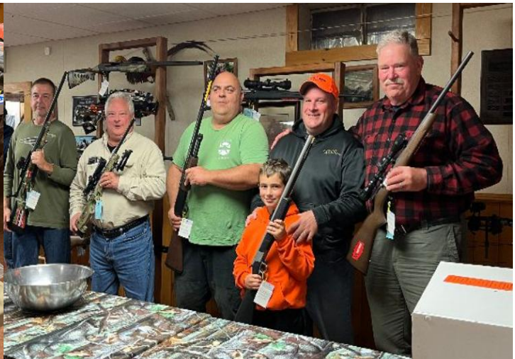
Some of the gun raffle winners (a few members too!)